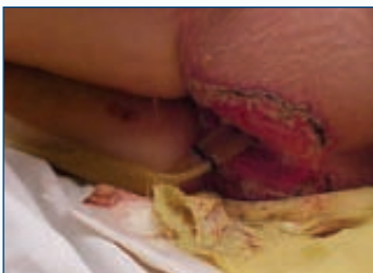
Day 1 with Flexi-Seal ® FMS 3