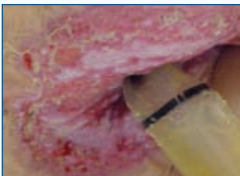
Day 5 with Flexi-Seal ® FMS 3