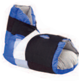
PREVALON® PRESSURE-RELIEVING HEEL PROTECTOR

Medicare Reimbursement HCPCS Code #E0191