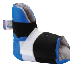
PREVALON® PRESSURE-RELIEVING HEEL PROTECTOR

Medicare Reimbursement HCPCS Code #E0191