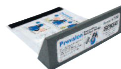
PREVALON® FOOT AND LEG STABILIZER WEDGE

Medicare Reimbursement HCPCS Code #E0191