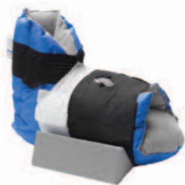
PREVALON® PRESSURE-RELIEVING HEEL PROTECTOR WITH WEDGE