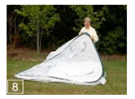
Step 8: Choose one of the top corners so the skirting does not get in the way. Fold your DreamHouse<sup>™</sup> in half. You will feel the tension of the spring steel. Move your left hand back to where your DreamHouse<sup>™</sup> is bent.