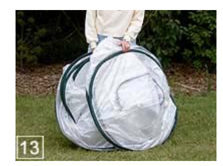
Step 13: Hold the DreamHouse<sup>™</sup> between your knees to prevent your DreamHouse<sup>™</sup> from springing open.