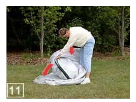
Step 11: Fold the right side down over the left side.