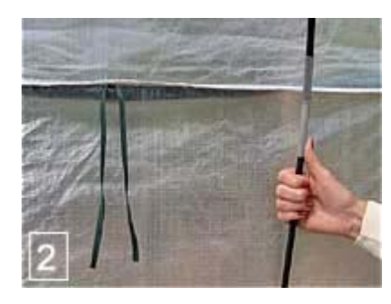
Step 2: Untie the straps holding the L-shaped fiberpoles in place. Move them to one side. This will relieve some tension.