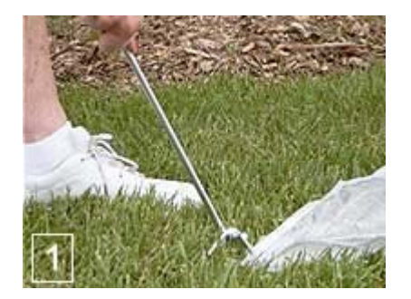
Step 1: Remove all highwind tie-downs and stakes. It may be easier for you to use the head of one stake to remove another.