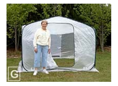
Step 6: Once the walls are spread apart, your DreamHouse™ will stand up on its own. Position your DreamHouse™ where you want it.