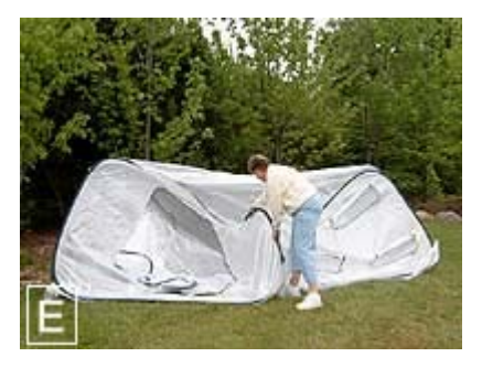
Step 4: Unzip the easiest accessible doorway and screen. Grab the center steel band and lift up to separate the two sides of your DreamHouse™.