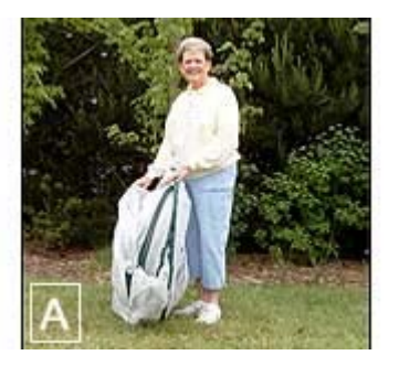
Step 1: Remove your DreamHouse<sup>™</sup> from the pack.