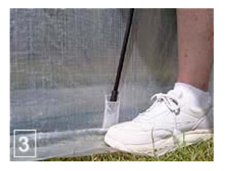
Step 3: Step on the skirting just under the pockets to remove the fiberpoles.