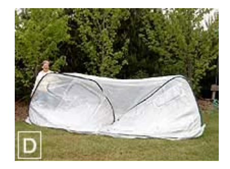
Step 3: Unfold your DreamHouse™ into 2 panels. Shown Above.