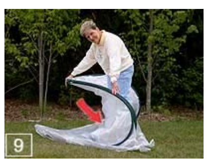
Step 9: Invert your hands. Fold the top corner under while you bring the left side up and over. While doing this, slide the entire DreamHouse<sup>™</sup> toward you.