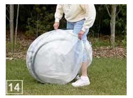
Step 14: Slide the pack over your folded DreamHouse™.