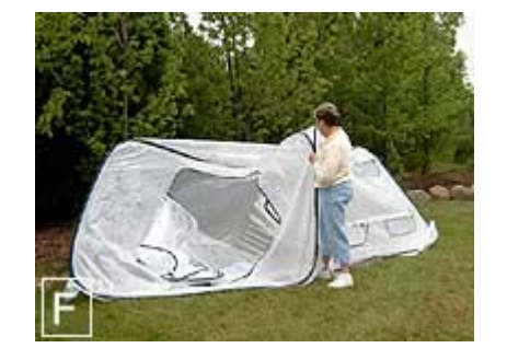
Step 5: While holding on to the center steel band, walk away to separate the 2 sides of your DreamHouse<sup>™</sup>. Continue pulling out on the band to spring it into place.