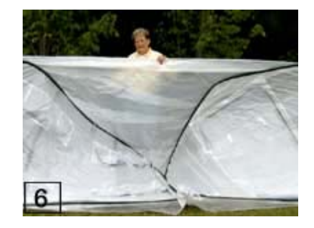
Step 6: Push firmly on the center steel band (shown in "F") to spring it back into place so your DreamHouse™ will fold inward.