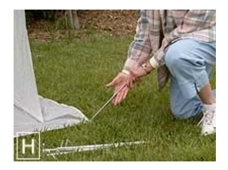
Step 7: Secure your DreamHouse™ using the supplied stakes. Insert the stakes into the stake holes of the skirt at 45° angles.