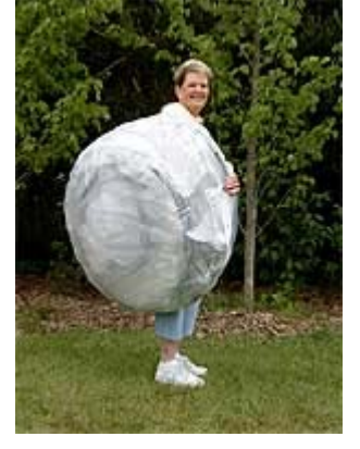
Step 15: Store the stakes and high-wind tie-downs in the pouches provided and place them in the pack. Now you can take your DreamHouse<sup>™</sup> anywhere!