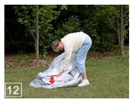
Step 12: When finished, your DreamHouse™ will form 3 rings on top of each other. Shown above.