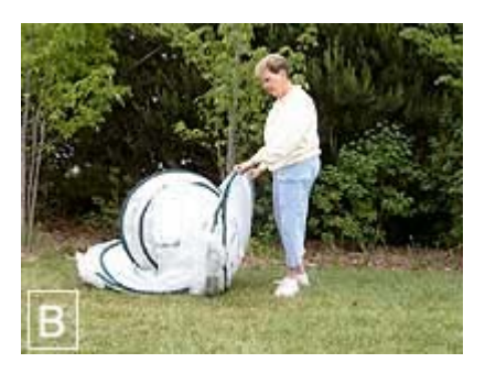
Step 2: Allow your DreamHouse™ to spring open.