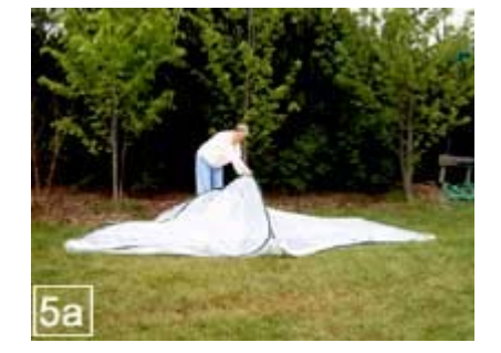
Step 5: Push one corner steel band of your DreamHouse<sup>™</sup> in toward the opposite corner. Tip your DreamHouse<sup>™</sup> so it lies on the ground. NOTE: It will not lay flat. See photos "5 & 5a" above.