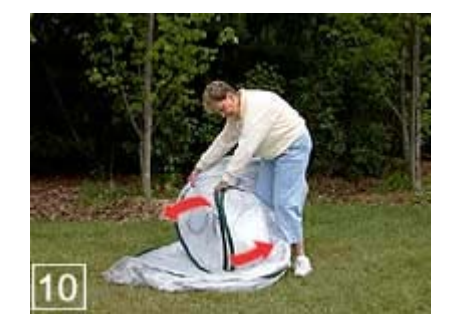
Step 10: Once the top corner is folded under, fold the left side down completely.