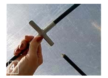
Step 4: Remove the L-shaped fiberpoles from the X-shaped fiberpole at the ceiling. Remove the fiberpoles from the ceiling. Step outside your DreamHouse<sup>™</sup> and zip the doors shut.