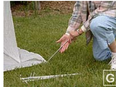
Step 7: Secure your SpringHouse™ using the supplied stakes. Insert the stakes into the stake holes of the skirt at 45° angles.