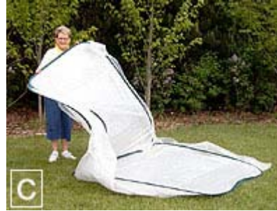
Step 3: Unfold your SpringHouse™ into 2 panels.