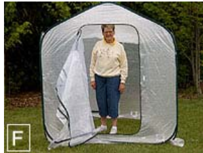
Step 6: Stand pm the bottom corner of the skirting and lift your SpringHouse™ over your head. Push out on the center steel band (Shown in fig. D) and left up to separate the two sides of your SpringHouse™.