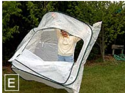
Step 5: Stand on the bottom corner of the skirting and lift your SpringHouse™ over your head. Push out on the center steel band (Shown in fig. D) and left up to separate the two sides of your SpringHouse™.