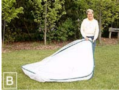
Step 2: Allow your SpringHouse™ to spring open.