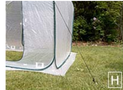
Step 8: You must secure your SpringHouse™ using the High-wind tie-downs. Insert one end of the rope through the D-ring in the top corner, then through the anchor. Knot the rope around a stake and insert it in the ground at a 45° angle. Keep as much tension on the rope as possible. Repeat this step with all corner locations, as well as the D-rings on the peak ends and top center of the side walls.