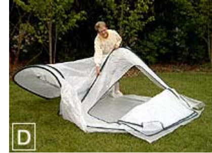
Step 4: Unzip the easiest accessible doorway and screen. Grab the center steel band and lift up to separate the two sides of your SpringHouse™.