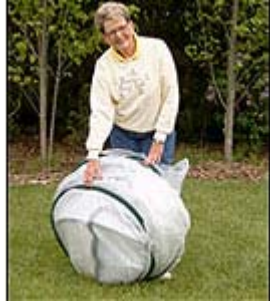
Step 1: Remove your SpringHouse™ from the pack.