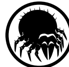
DUST MITE DEBRIS