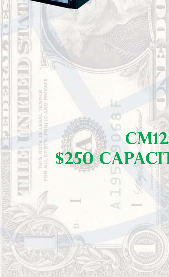
CM1250 $250 CAPACITY