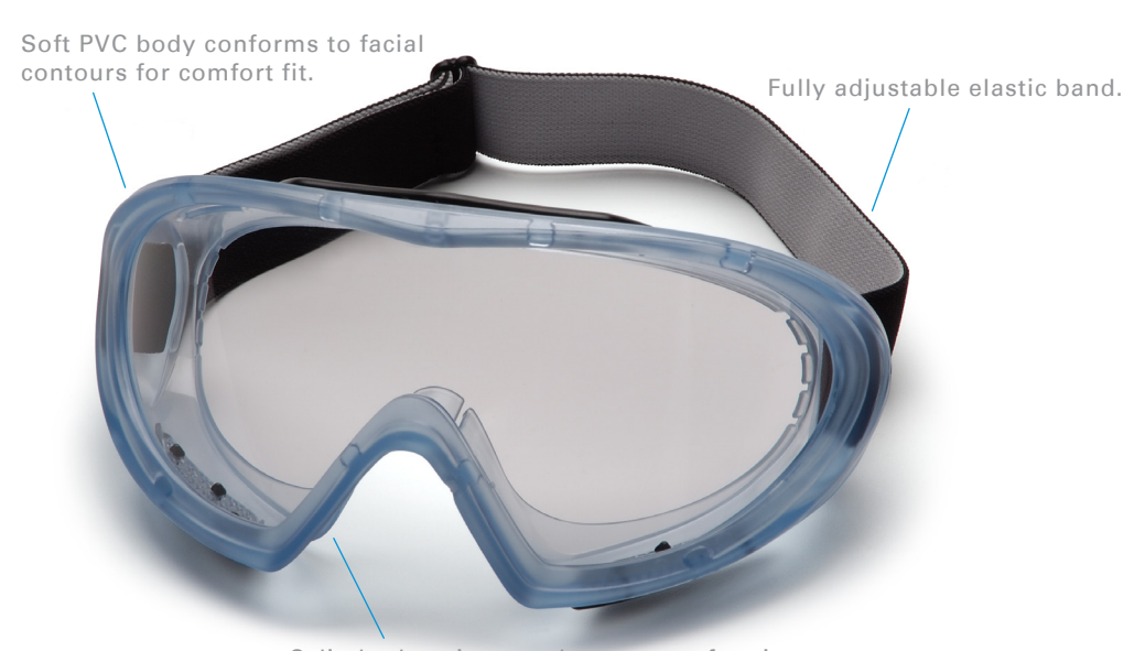
Cylinder lens is coated to prevent fogging and fits over prescription glasses.