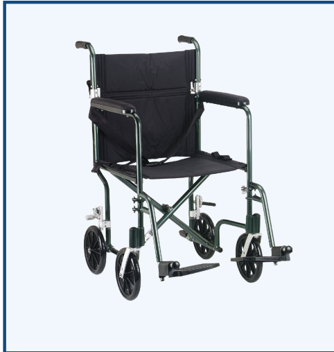
Item # FW19GR Shown

It is important for the attendant to be familiar with proper assisting procedures in any situation that requires the use of the Transport Chair. Safety is the Key consideration. Consult your physician, nurse or physical therapist to determine methods most suitable for your individual needs and abilities.