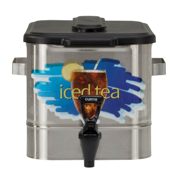
TCO-308 (3 gal. dispenser)