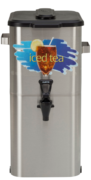
TCO-419 (4 gal. dispenser)