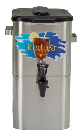
TCO-417 (4 gal. dispenser)