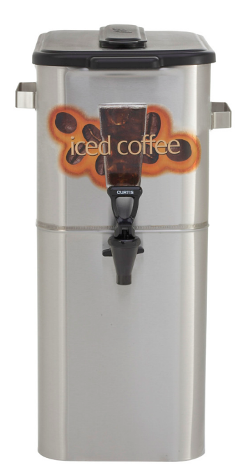
TCOC-421 (3 gal. dispenser w/Coffee Graphic)