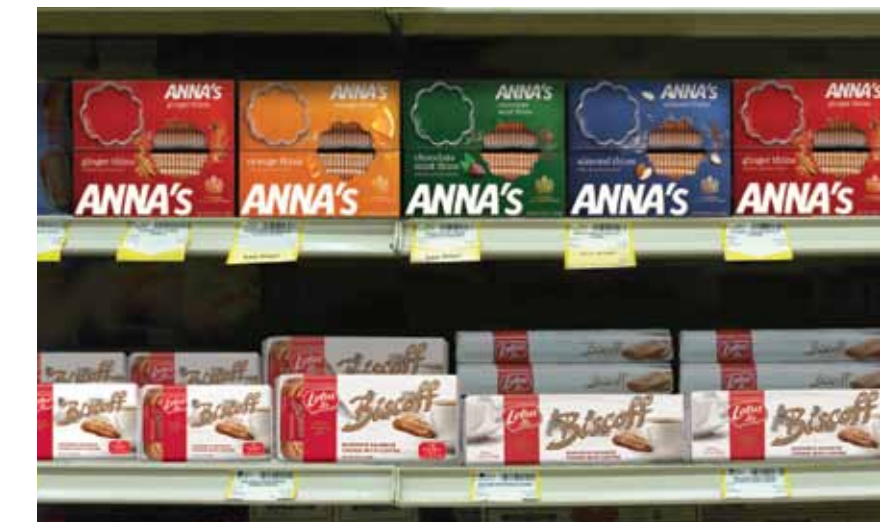
Lotus Bakeries cookies, Anna's and Biscoff, found in the specialty cookie section

Biscoff Twin Pack Extra large rectangular Biscoff are packed two in a wrapper.