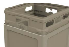
Grab Bag System