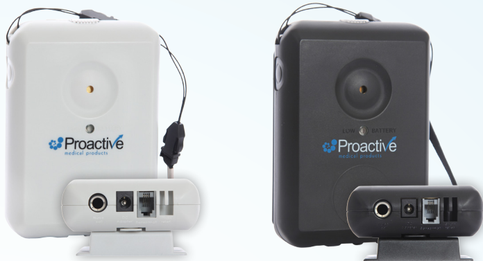
Item # 10260W - White