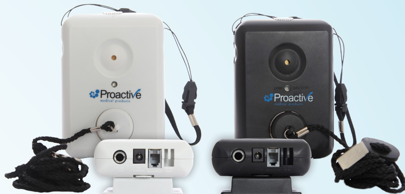
Item # 10270W - White