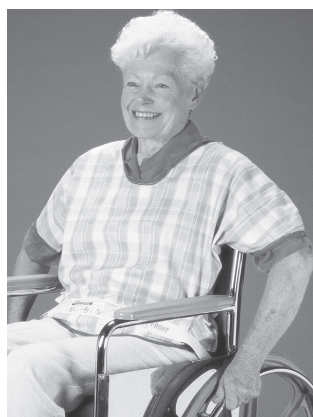
Available in cotton/poly plaid, breezeline mesh, flame retardant, and white cotton.