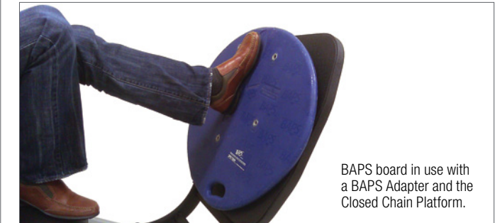
BAPS board in use with a BAPS Adapter and the Closed Chain Platform.

You may need to lift it slightly for both sides of the lever to pop into the holes. STEP 6. To use the BAPS Adapter, insert the base of the BAPS Adapter into the round opening on the front of the CCP. Secure it at the desired height with the detent pin on the back of the CCP as shown.