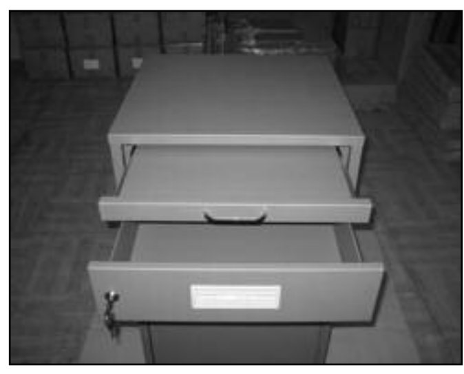
Step 7 For LMC2 ONLY

Insert shelf holder brackets into tabs at desired height on inside of unit making sure all tabs are at the same height. Place shelf inside on brackets.