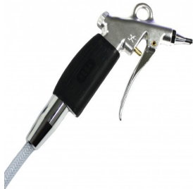
Cleaning Spray Gun