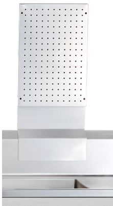
Peg Board (Image is representative)