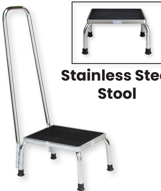
Stainless Steel Stool

Width: 14 1/4" x Height: 9" x Depth: 11 3/8"