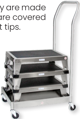
Dolly Dimensions: 21 1/2" x 39" x 16 1/2"