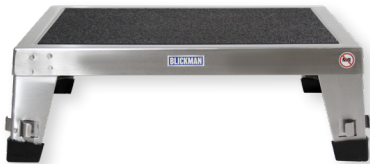
EZ Stool Dimensions: 18 7/8" x 6 1/4" x 13 7/8"

Description: Our EZ stacking stools and dolly are made with our durable stainless steel. The stools are covered with a non-slip rubber tread and feet tips.