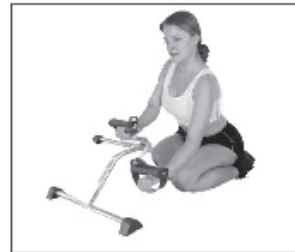
HAND ROWING EXERCISE