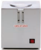
GEM-5 — Heated Satellite Stand (Tall)