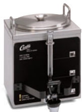
GEM-3— Insulated Satellite Server