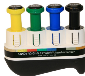
Digi-Flex Multi® hand exerciser