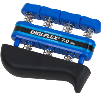
Digi-Flex® hand exercisers