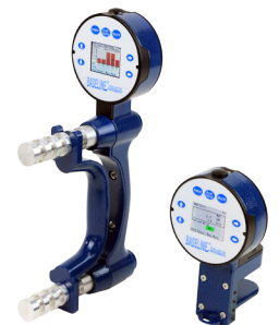
Baseline® digital dynamometer and pinch gauge