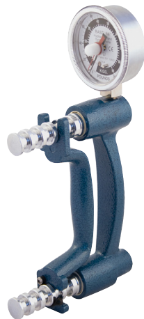
Baseline® hand dynamometer