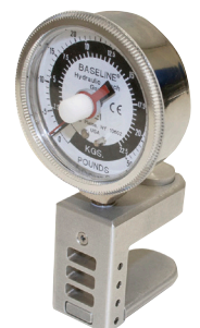
Baseline® multi-position pinch gauge

TheraPutty, Puttycise, Digi-Flex, Digi-Flex Multi, and Baseline are registered trademarks of Goldberg. © 2016 all rights reserved