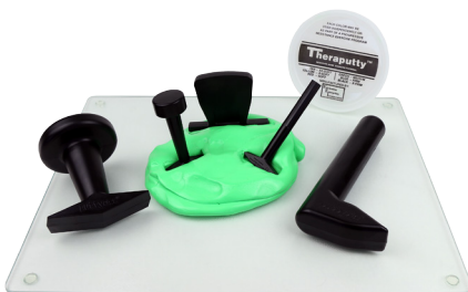
TheraPutty® & Puttycise®