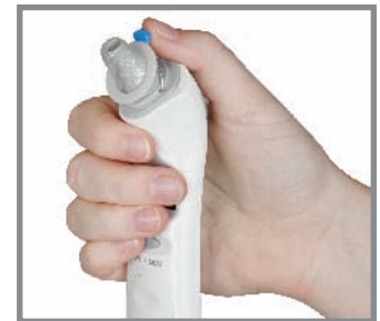
After reading, flip the blue tab to release the disposable probe cover without contact.

Medline Industries, Inc. One Medline Place Mundelein, Illinois 60060 www.medline.com 1.800.MEDLINE