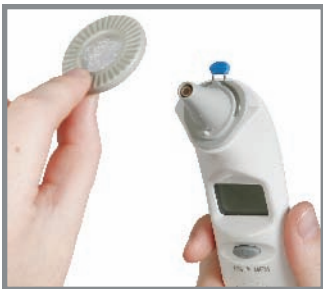
Apply disposable cover onto the tympanic thermometer.

To order your Tympanic Thermometer with Quick Probe Release, please contact your local Medline representative, call 1.800.MEDLINE or visit us online at www.medline.com .