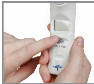
Turn device "on" by pressing button on front.