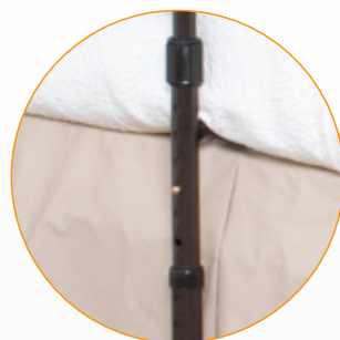
Adjustable Legs Provide Stability