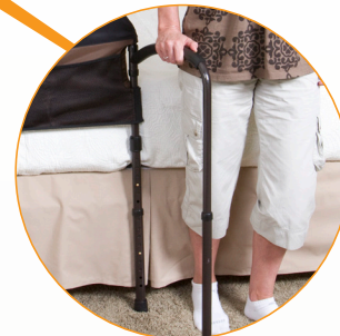
Arm Pivots 180°