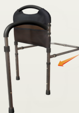
Attach Base Tubes to Main Handle