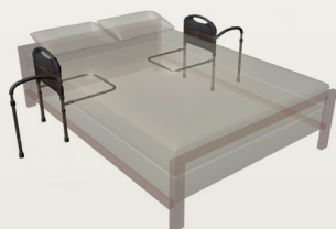
Adjust Base Tubes to Accommodate Left or Right Side of Bed