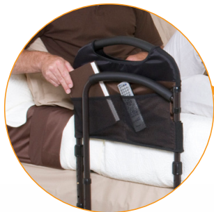
Includes a Bonus Organizer Pouch