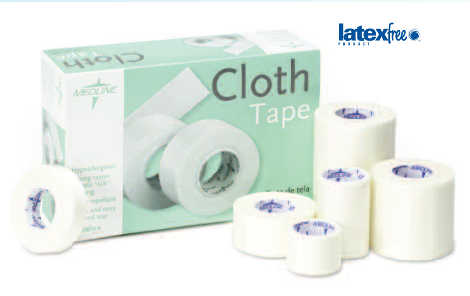
* Compare to 3M^{\scriptscriptstyle TM} "Durapore ^{\scriptscriptstyle TM} "