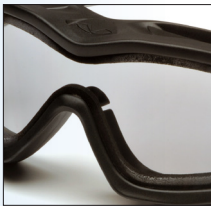
Special indirect ventilation system