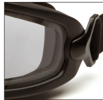
TPU Frame forms perfect facial seal