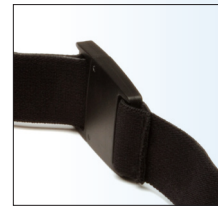
Wide Adjustable Elastic Strap with Quick Release Clasp