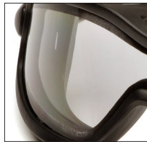
Dual Pane Thermo Lens System