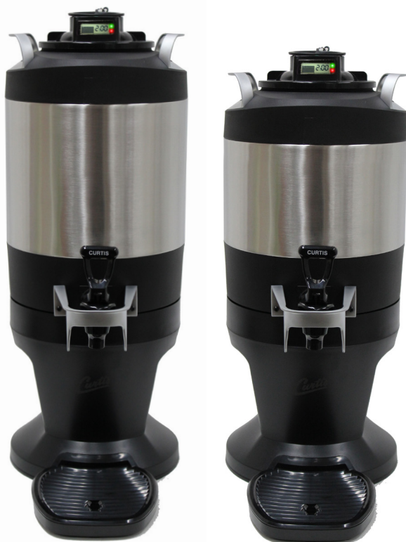
TFT15G 1.5 Gallon Dispenser