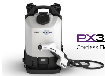
PX300ES Cordless Electrostatic Backpack Sprayer