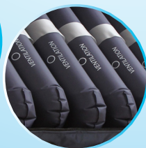
Low Air Loss