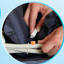
Easy Valve Exchange